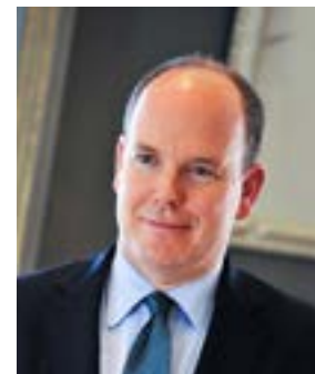
HSH PRINCE ALBERT II OF MONACO